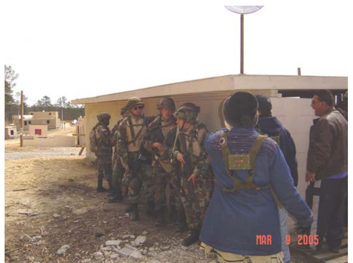
B Co soldiers prepare to enter the objective, a building they believe to be a weapons cache. They are confronted by actors, role-playing Iraqi civilians, which adds more realism to the training.